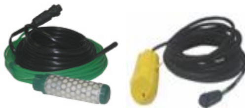
Fig 3: Temperature / Humidity Sensors

ES1201 is a temperature/humidity sensor that measures the ambient relative humidity and air temperature.