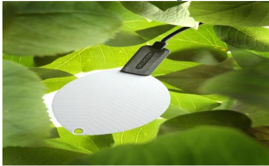
Fig 4: Leaf wetness sensor[8]