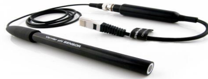
Fig 5: pH sensor[9]

Environment temperature sensors , Smoke detectors are also available in market.